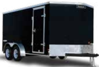
PASSPORT Smart Value ★★★