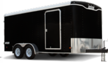
KODIAK Premium Value ★★★★★