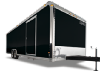
EDGE Premium Value ★★★★★