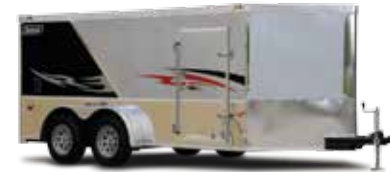
LOW HAULER Premium Value ★★★★★