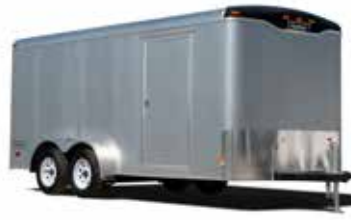
TRANSPORT Enhanced Value ★★★★